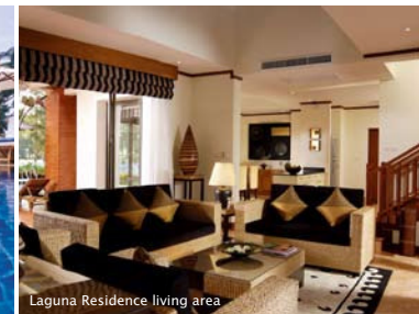
Laguna Residence living area