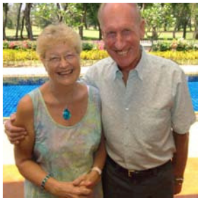
The Donalds at their Residence: Golf and swimming every day keeps them cheerful