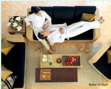
Relax in style

Laguna's latest residential development, Laguna Village, embodies all the elements that have made Laguna Phuket synonymous with bright ideas and comfortable living.