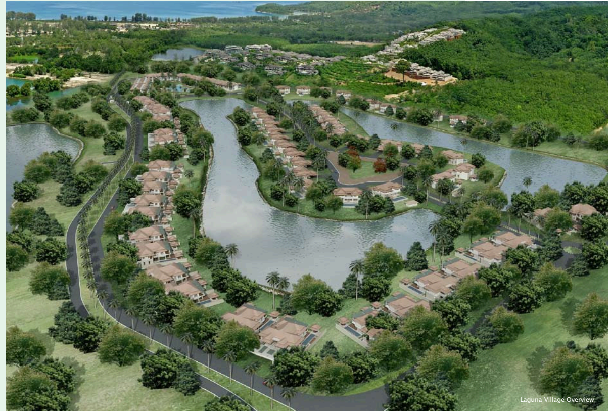
Laguna Village Overview